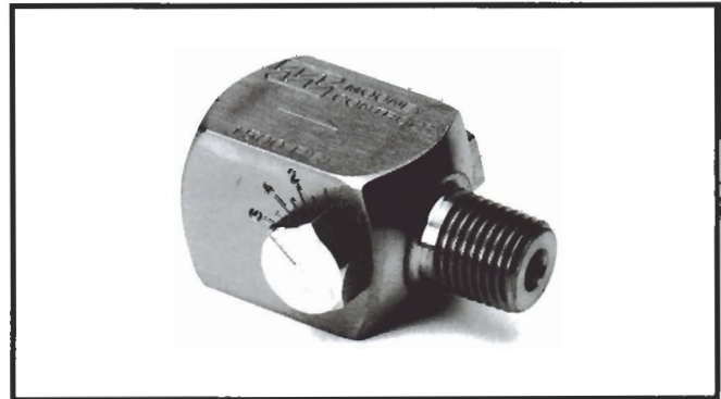
Figure 1. TYPE 24 MOONEY® RESTRICTOR

Personal injury, equipment damage, or leakage due to explosion of accumulated gas or bursting of pressure containing parts may result if this RESTRICTOR is overpressured or is installed where service conditions could exceed the limits given in the specification of the nameplate, or where conditions exceed any ratings of the adjacent piping or piping connections. Verify the limitations of valve, pilot, and restrictor to ensure these devices are not overpressured. To avoid such injury or damage, provide pressure relieving or pressure limiting devices (as required by Title 49, Part 192, of the U.S. code of Federal Regulations, by the National Fire Codes of the National Fire Protection Association, or by other applicable codes) to prevent service conditions from exceeding those limits. Additionally, physical damage to the valve/regulator could break the pilot or restrictor off the main valve, causing personal injury and/or property damage due to explosion of accumulated